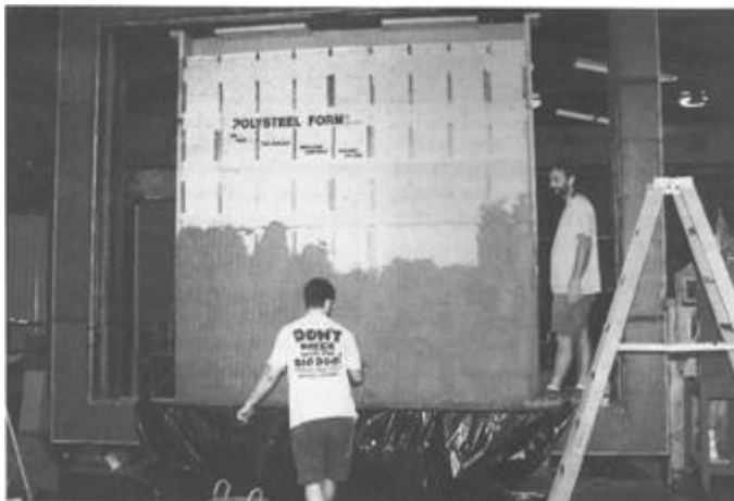
An insulating concrete form with metal ties is prepared for testing at the Buildings Technology Center. Its whole-wall R-value and thermal mass will be measured.

Interesting comparisons can be made using the data in Table 1 to illustrate the importance of using a whole-wall value to select the most energy-efficient wall system. It could be argued that the difference between the clear wall and whole-wall R-value represents the energy savings potential of adopting the rating procedure proposed in this paper. Most building owners assume that they have the higher clear-wall value, rather than the more realistic whole-wall value.