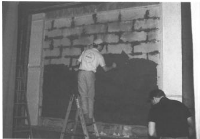
An autoclave concrete wall is stuccoed in preparation for the hot box test.

A number of innovative wall systems offer advantages that will continue to gain acceptance as the cost of dimensional lumber rises, the quality of framing lumber declines, availability fluctuates, and consumers remain concerned about the environmental impact of the unsustainable harvesting of wood. For instance, while common dimensional lumber systems historically represent about 90% of the market, metal framing manufacturers anticipate attaining 25% of the residential wall market by the year 2000. This projection may be a bit optimistic, but it is clear that cold form steel is set to make major inroads into the residential market.